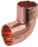
Copper 90 Deg Elbow