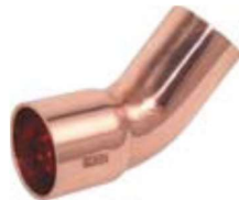
Copper 45 Deg Elbow